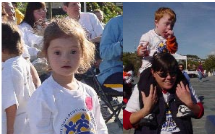
2004 Buddy Walk